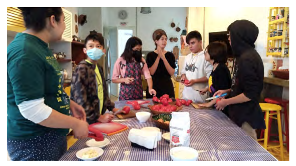
Course Self-managed Nutrition.

Over the course of five sessions, the neighbors from UMANI fermentos held the course Self-managed Nutrition for youths aged between 12 and 20. The participants learned to rationalize and reflect upon their nutritional choices, while they prepared various dishes. To conclude, they carried out an exercise on choosing and purchasing fresh ingredients in the Dalia market, which they used to jointly prepare a dish to share with the community.