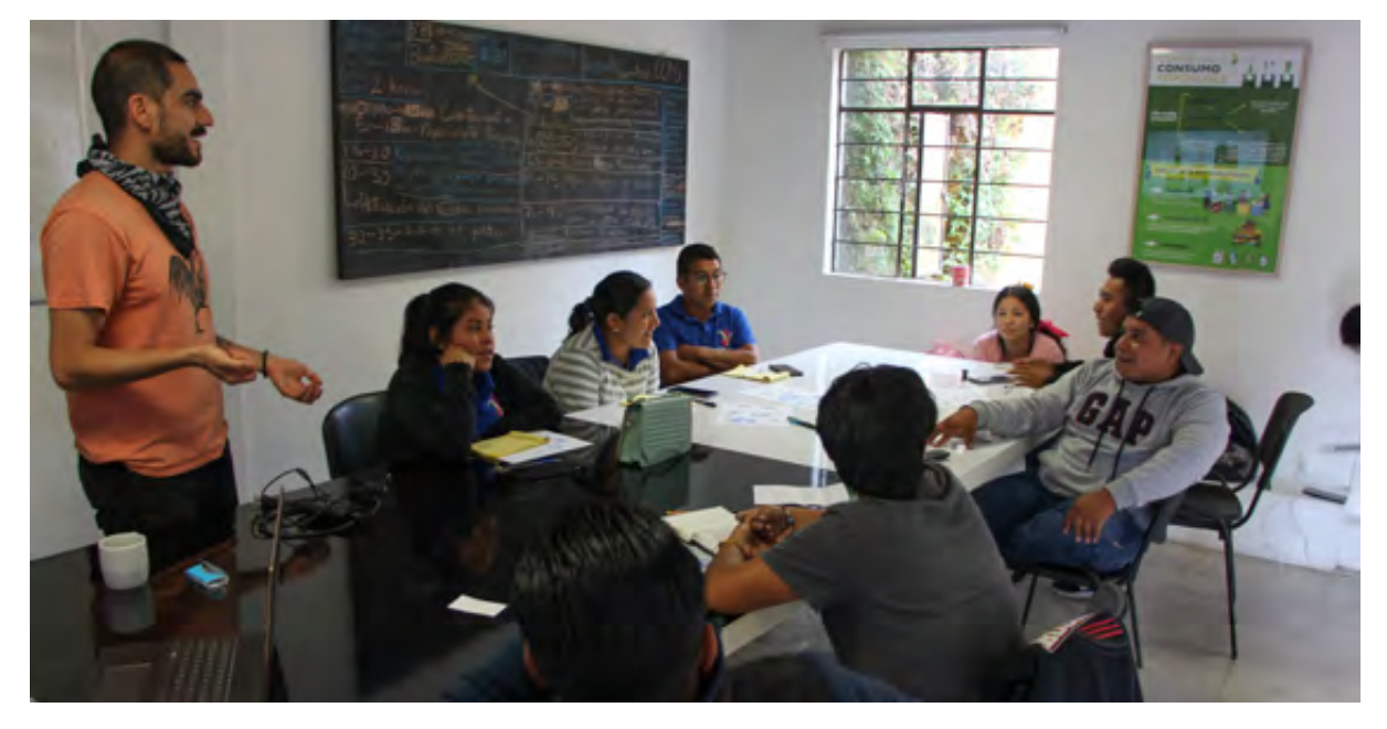
Session of the encounter Educating From the Environment.

From September 26 to October 1, Casa Gallina welcomed community promoters from the Centro Comunitario Productivo de Ocomantla (CCPO), in Puebla, and Ixim A.C. from Chiapas, to take part in the encounter Educating From the Environment . In this phase the participants shared their experiences and lessons learned regarding educational work with children. They held working sessions with some of Casa Gallina's recurrent partners and had joint planning sessions in order to subsequently implement the knowledge acquired during these meetings within their communities.