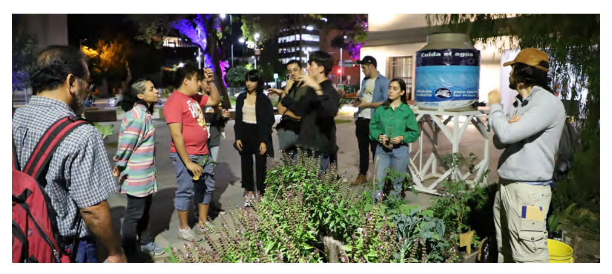
Workshop Learning By Doing, Communal Home Orchards in the LABNL Lab. Cultural Ciudadano.

Distributions of the books Life in my Surroundings, How to Integrate Into the World Naturally and We Make Our River were held with neighbors and local educational institutions and 40 allies in various territories such as Veracruz, Oaxaca, Milpa Alta and Yucatan. Some of them launched activations of the material, such as: Calpulli Tecalco in Milpa Alta: two distance-learning middle schools in the state of Veracruz -Angel Estrada Loyo in Chacaltianguis and Valentín Gómez Farias in Amatitlán-; the Zongolica creative nursery of ilustration, also in Veracruz; as well as the Muuch' Xíinbal assembly in Dzoncauich, Yucatan.