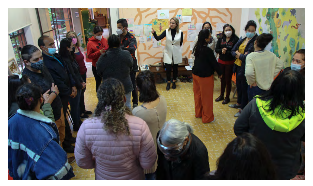
Activity of workshops for Primary Caregivers

During the last quarter of the year, Casa Gallina's programming has maintained its two main axes: on the one hand the in-house activities aimed at the residents of Santa Maria la Ribera and on the other, establishing collaborative networks with similar agents in other territories. Both these axes constantly intertwine to create joint projects that express diverse cultural practices to gather a community around reflection and actions regarding the environment.