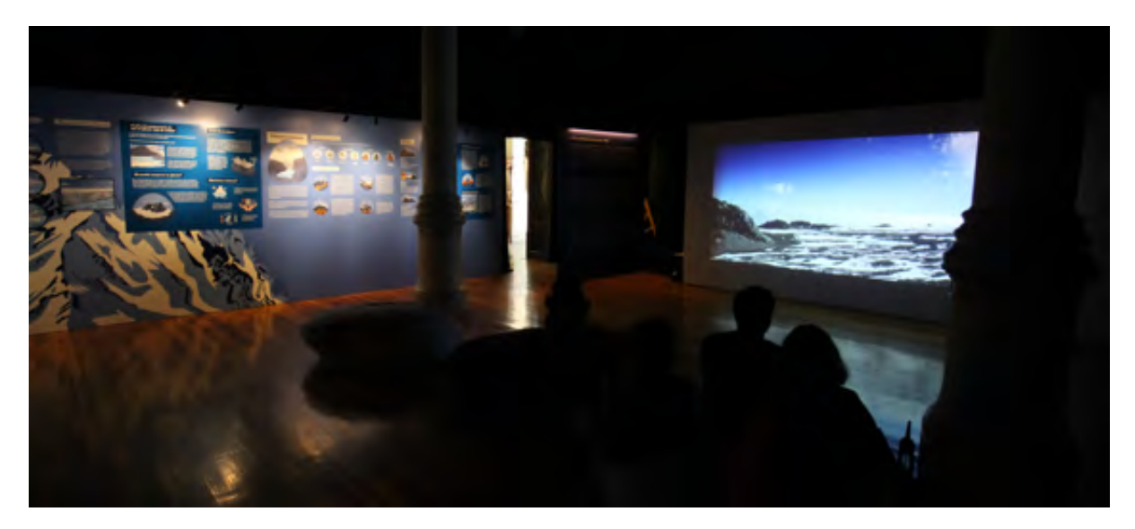
Exhibition Devenir in Geology Museum.

The exhibition Devenir was held in the Geology Museum, which included the