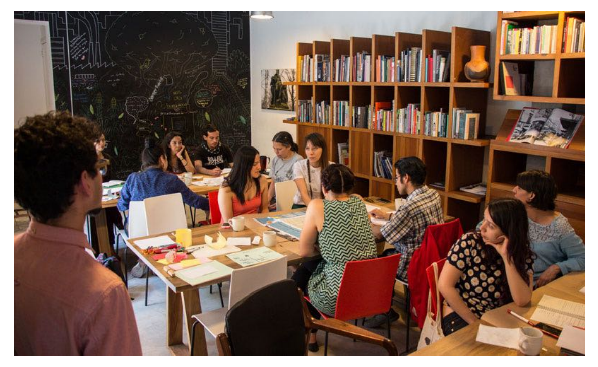
Working session of Our School Is Also Our Neighborhood: Prototypes Laboratory.