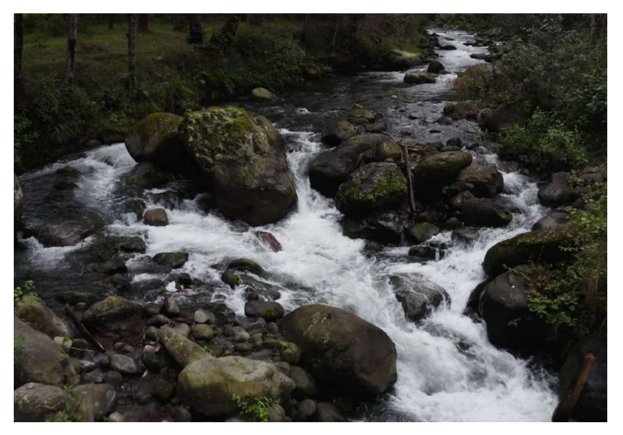
Still from the video Devenir by the artist Tania Ximena

Cooperation with artists continued on projects with a communal scope. Circe Irasema completed a collaborative process with the community in the Public Junior High Moisés Sáenz, creating the piece Silvestre Sonora that reflects on fauna in the Valley of Mexico and will culminate with the installation of a metallic mural in one of the school's gardens, in early 2022.