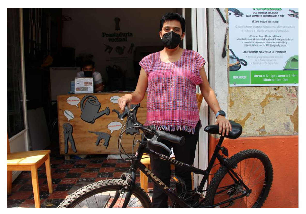
Prestaduría vecinal (Tool lending community service)

Casa Gallina kept up the service of loaning electronic equipment and maintained the Prestaduría vecinal (tool lending community service) that reached 1,394 loans for the 375 neighbors enrolled, who this year made significant donations of 6 implements —including a bicycle— which enabled us to increase the collection for communal use.