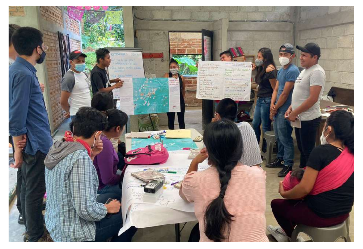
Collective mapping session carried out by Kolijke in the Community and Productive Center of Ocomantla, Puebla

This year we launched the implementation of two medium-term programs with agents in other latitudes. Constellations: Training Organizations and Community Agents to Use and Activate Collective Mapping which enabled the creation of a place to exchange and reflect led by the Argentine collective lconoclasistas (Julia Risler and Pablo Ares) in which 10 organizations generated 13 maps of each of their territories to activate them collectively. Meanwhile, the Training Program on Environmental Education: I Recreate the City fostered dialogue on how to engage the table game of the same name in classrooms for 64 teachers and 3,268 students in schools in the states of Campeche, Oaxaca, Guerrero and Mexico City.