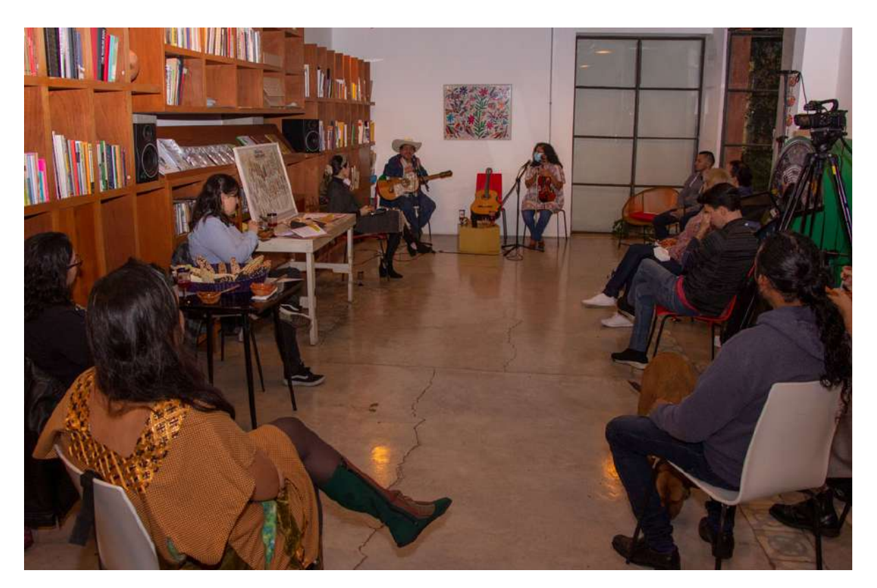
Musical Flavors with Ahuejote: música y danzas de la tierra

This year we reactivated the platform of neighbors' meetings through the program Musical Flavors , where inhabitants could share their experiences accompanied by traditional and ethno-musicians. Through music and food, neighbors linked up with rural customs that combine musical and culinary traditions. This year two encounters took place; the first with the duet Ahuejote: música y danzas de la tierra that shared ancestral flavors on the riches of the maize field with songs and Nahuatl melodies from the southern part of Mexico City; the second was a collaboration with the duet La Mar , that interpreted traditional music and rhythms for the Day of the Dead with instruments from the state of Oaxaca, such as earthenware pots, cajón percussions, Mixtec jarana guitar and the seven-string guitar.