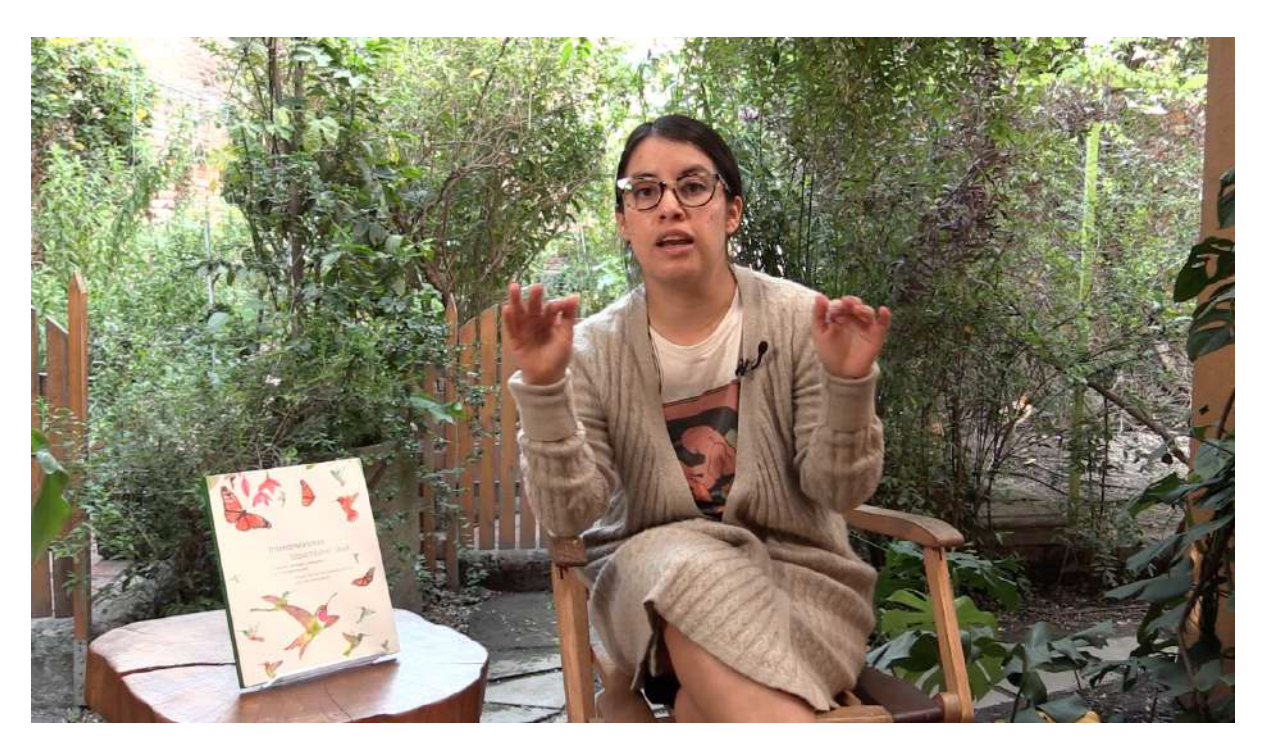
Collective reading of the book Interconnections: Large and small creatures in the same world.

As a fundamental axis of the work undertaken during 2020, the Casa Gallina team prioritized the generation and strengthening of networks with initiatives in other territories. The two publications launched this year focused on environmental issues relevant to urban and rural contexts. Constellations: Manual of tools for collective mapping introduces important content that bets on collective knowledge in the interaction between communities and their territories; the children's book, Interconnections: Large and small creatures in the same world , that reflects on the relationship of human beings with fauna. These books, published in Spanish and five native languages (Tsotsil, Purépecha, Wixárika, Ombeyiaüts and Tseltal), have been distributed among 17 organizations across the country.