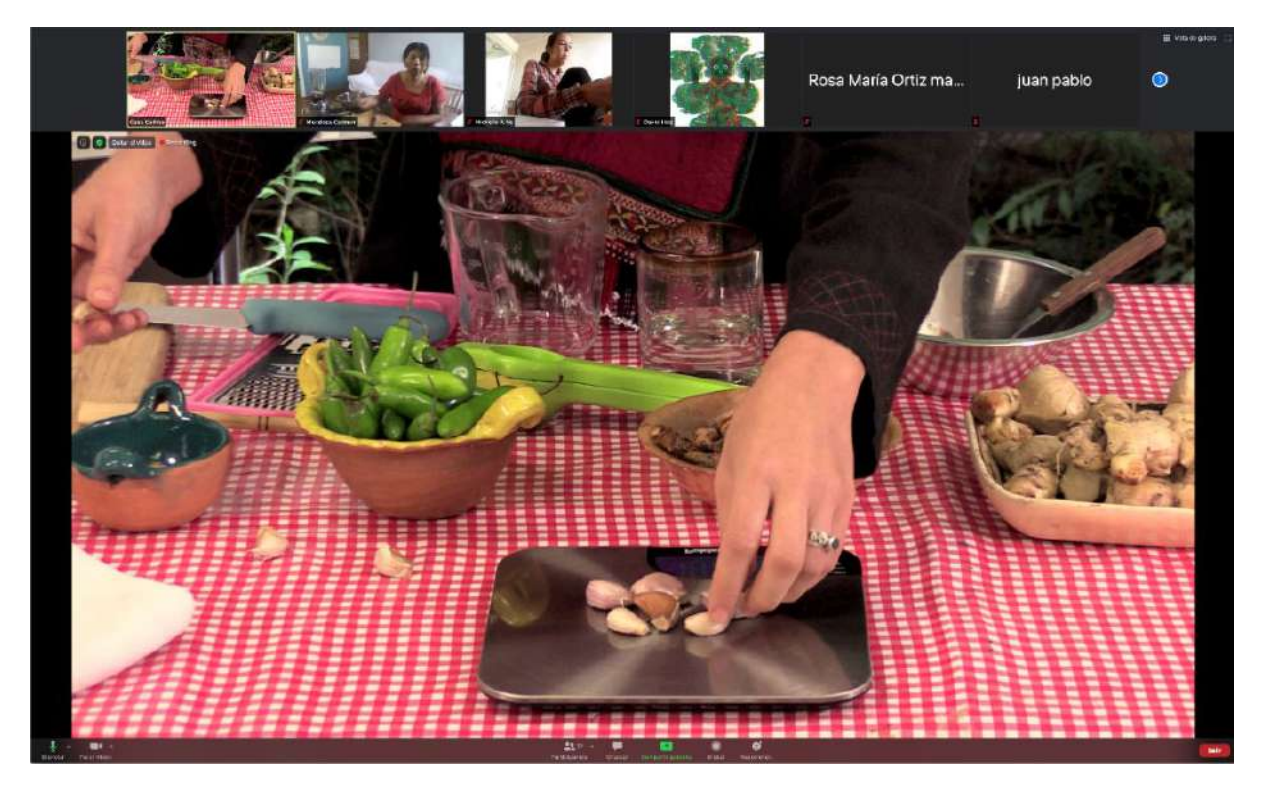
Workshop: Herbal preparations with Sami Esfahani.

This year's educational program remained active through 32 workshops and 42 talks taking place in both face-to-face and digital formats. They focused on nutrition, resilience, environmental empathy, and responsible consumption; participation included 560 registered residents and 1508 people who followed the broadcasts live on Facebook. This platform also held workshops aimed at children from local public schools, meaningfully involving their parents or guardians in the learning processes in order to strengthen intra-family ties. In addition, two networks were activated: one for calls between neighbors during the confinement that attended 24 neighbors and one for those interested in orchard issues that has now reached 72 active participants.