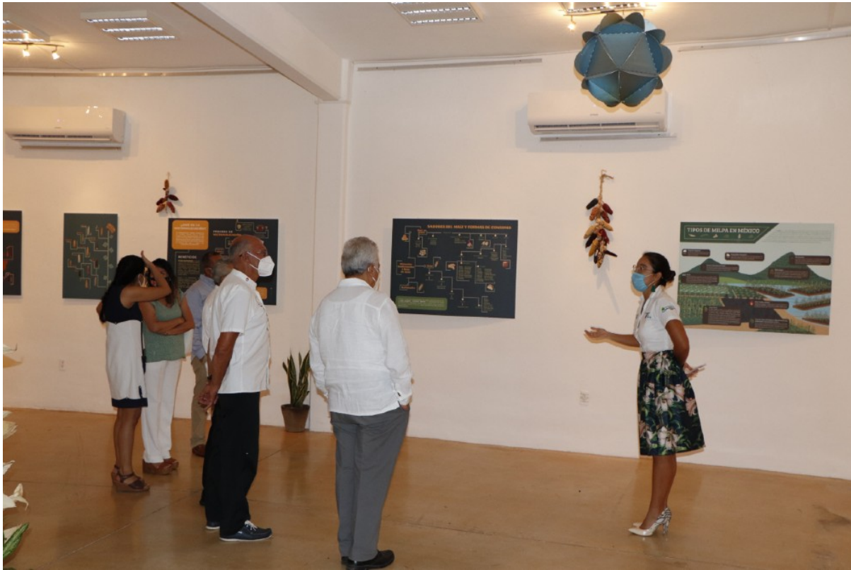
Maize, Cornfields and Biodiversity in Mexico , exhibit at the Cancún Ka'Yok' planetarium