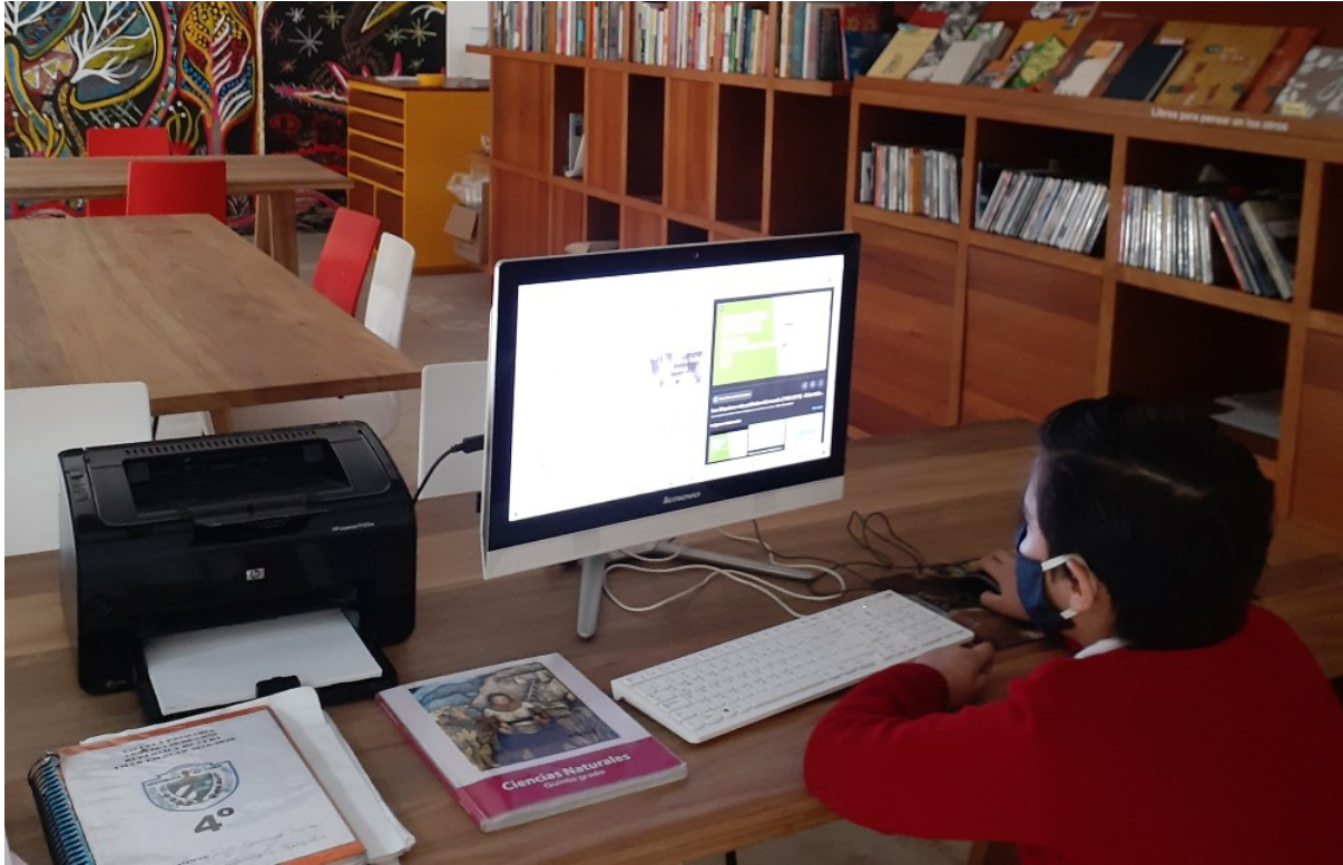
A neighbor attending his virtual class from Casa Gallina

Although Casa Gallina has not been able to fully open its doors, it maintains two active community service programs. One is the neighborhood Prestaduría , a tool-lending service for the residents of Santa María la Ribera. The other is aimed at children from local public schools; they are given access to computers, printers and the Internet to either take their classes online or do homework.