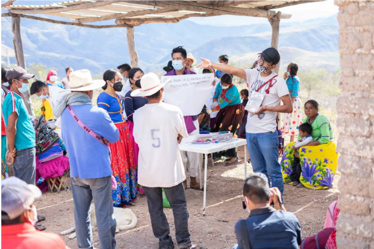
Colectivo Juvenil de Pueblos Originarios A.C. teaching a workshop at the Encinos community, an annex of Guadalupe Ocotán, in La Yesca, Nayarit.

During the first four months of 2021, Casa Gallina continued its programming focused on the environment, nutrition and cuisine. The programs were put in to operation through digital platforms and social networks.