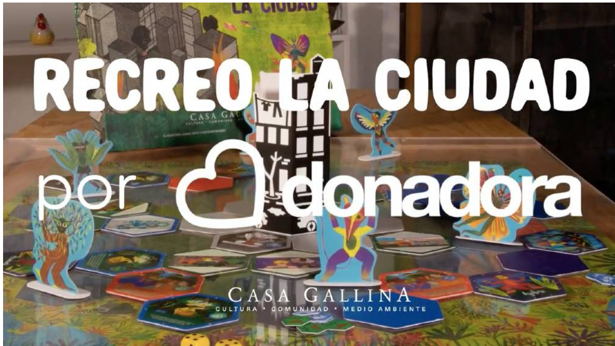
Still from the I Recreate the City campaign with Donadora.

In February, the first crowdfunding campaign carried out by Casa Gallina through the Donadora platform came to an end. Its purpose was to raise the funds to distribute the I Recreate the City board game to at least 50 public schools located in communities in various Mexican states (Guerrero, Campeche, Oaxaca and Mexico City), and implement an environmental program for educators.